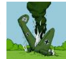
May 8th 1941 ..... A GERMAN HEINKEL HE 111 WAS CAUGHT IN THE GLARE OF SEARCHLIGHTS LOCATED IN POYNTON AS IT LUMBERED SLOWLY ACROSS THE SKY, BEFORE BURSTING INTO FLAMES AS IT WAS HIT BY 800 ROUNDS OF AMMUNITION FIRED FROM A NIGHT FIGHTER. THE PLANE CRASHED IN A BALL OF FLAMES CLOSE TO THE 6TH FAIRWAY. THE CREW OF FOUR BLED OUT BY PARACHUTE AND WERE CAPTURED ALMOST IMMEDIATELY ON LANDING, ONE HAVING RUN ACROSS THE COURSE TO THE MAIN ROAD IN A VAIN ATTEMPT TO ESCAPE.

A slight help to the club's finances came in October 1940 when Stockport and Hyde Assessment Committee revalued the club and course for rateable value, reducing the rates of the Clubhouse and buildings from £167 to £124 and of the course from £222 to £167. But in December, given the state of the