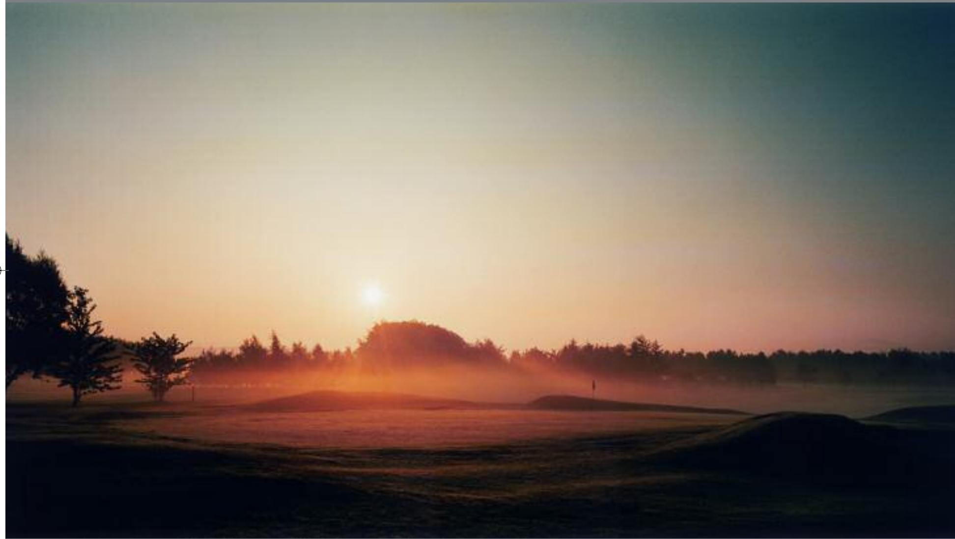
DAWN OVER THE 16TH GREEN

Unlike some other clubs, Stockport maintained its regular men's Committee meetings throughout the war and the minutes taken were remarkably full. They record the health and activities of the club, and its many contributions to the war effort. More than that, they provide valuable glimpses into daily life during these dark years.