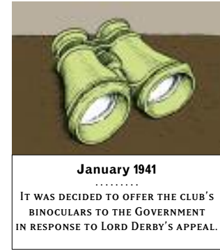
January 1941 ..... IT WAS DECIDED TO OFFER THE CLUB'S BINOCULARS TO THE GOVERNMENT IN RESPONSE TO LORD DERBY'S APPEAL.