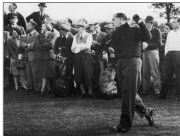
COTTON DRIVING ON 4TH TEE